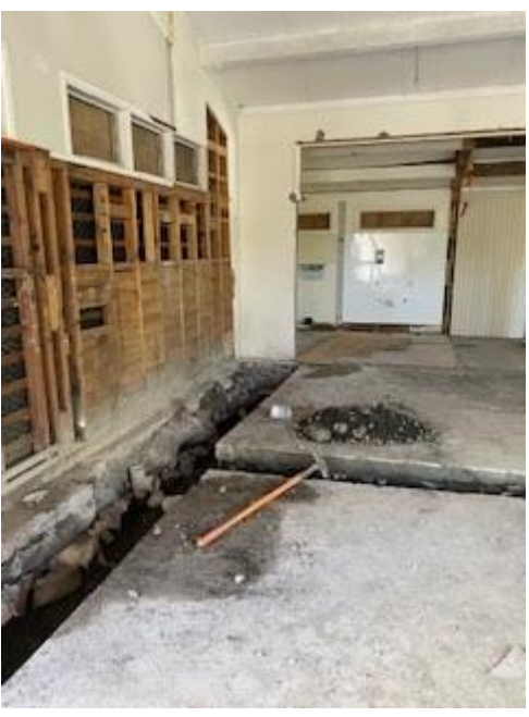
Ablution upgrade at Rathkeale