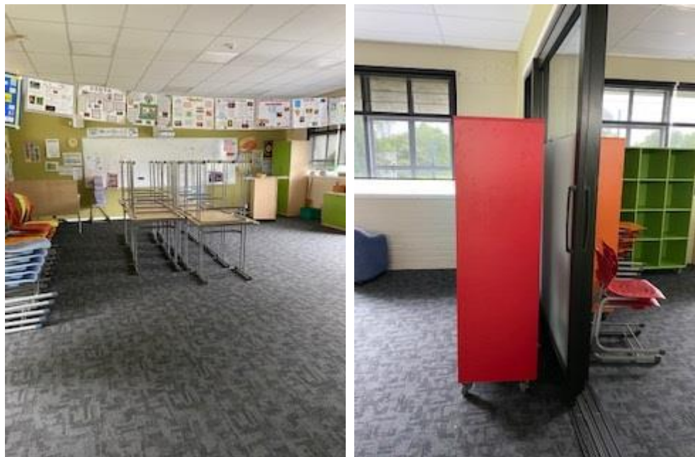
Refurbished intermediate classrooms in St Matthew's

The internal earthquake-strengthening and refurbishment of the St Matthew's Lower Classroom Block was completed at the start of 2022 and the Year 7 and 8 students and staff are enjoying the refreshed classrooms.