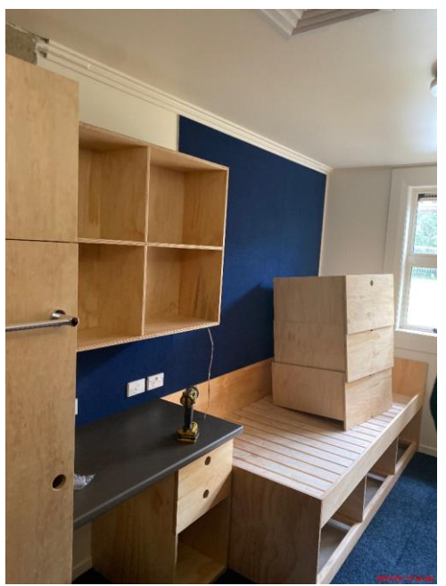
Dormitory upgrade at Repton House

The ablutions in Classroom Block A at Rathkeale are being upgraded into a gender-neutral facility that can be used by students, staff, parents, whanau and other visitors. The anticipated completion date is April 2023.