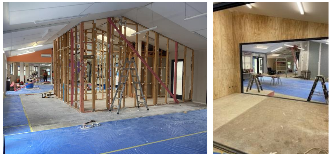
Hub 1 and 2 upgrade at Hadlow

The Hub 1 and 2 project at Hadlow is progressing well. Locker spaces are converted into learning spaces and a sliding door will be added between Hubs 1 and 2. We anticipate completion during April 2023. TSTB thanks all the teachers who have moved into temporary classrooms and continued teaching so well in less than ideal settings.