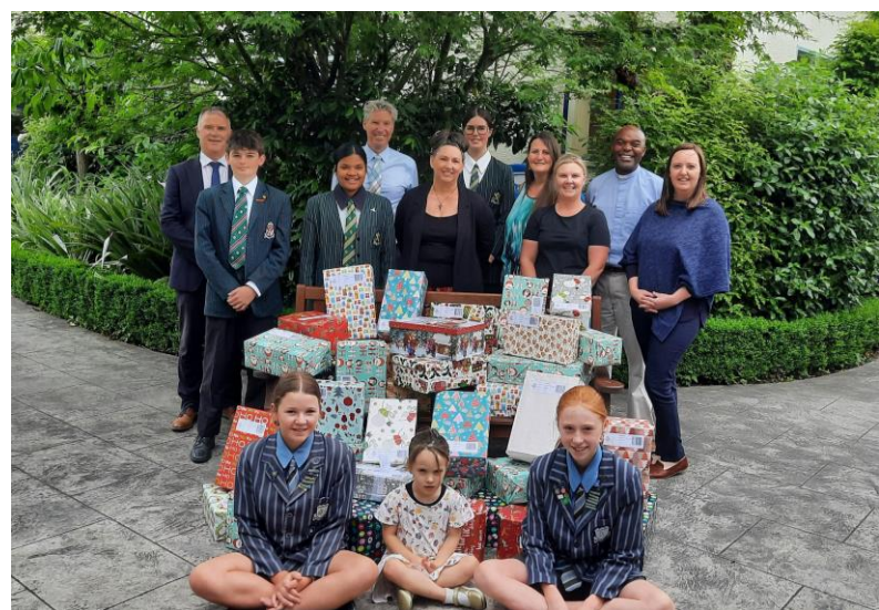
In November, Trinity staff and students supported Shoebox Christmas Aotearoa.

Our Trinity family strives to put God's love in action. Various fundraising and community projects have been undertaken by students, staff and families during 2022. The Shoebox Christmas Aotearoa project was one example where all Trinity entities united and contributed 47 shoeboxes, filled with Christmas gifts, to local Wairarapa children who can do with an extra smile on Christmas Day.