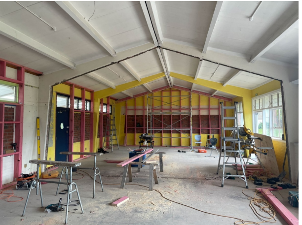
St Matthew's Lower Classroom Block