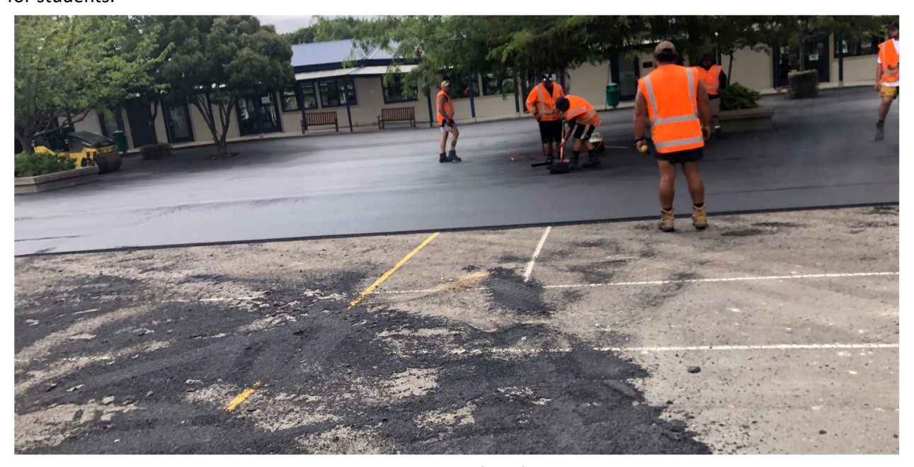
Contractors laying the new surface for the Hadlow Quad

A full resurfacing and remarking of the Hadlow Quad was completed in early 2021. The old seal was well past its best and large puddles formed when it rained. The new surface now provides a quality play area for students.