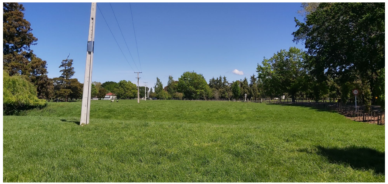
The recently purchased 6.25 hectare block at Rathkeale College

As a result of significant vision and fundraising from the Rathkeale Friends Association and the Rathkeale Old Boys Association we purchased a 6.25 hectare block of land that borders the entrance to the Rathkeale College site (below). The land will form part of the 'Rathkeale Landlab' and the bush will be carefully managed to encourage new native growth.