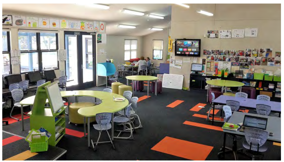
Hadlow modern learning spaces – open, warm, bright and student friendly.

In 2017, proprietor funds will enable other projects to commence, all with a view to enhancing the facilities at our schools.