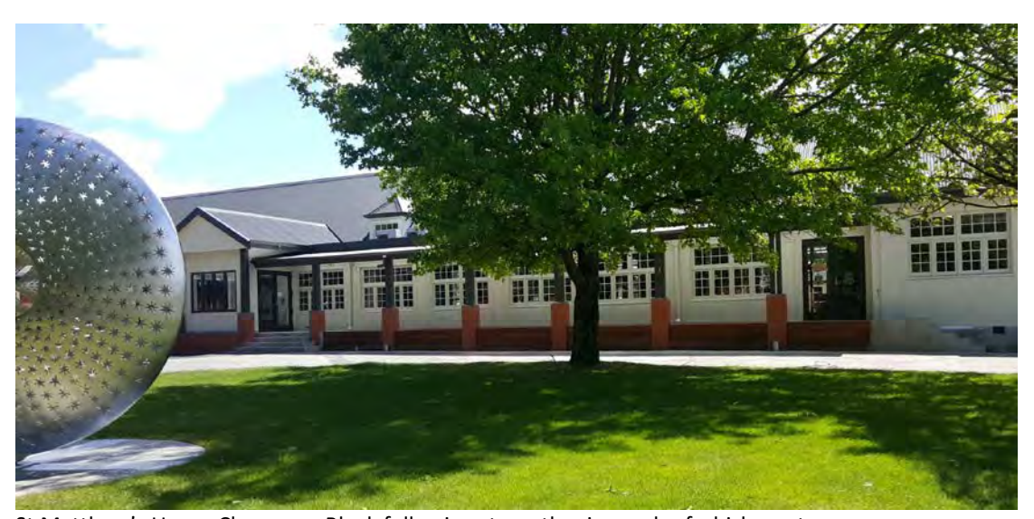
St\ Matthew's\ Upper\ Classroom\ Block\ following\ strengthening\ and\ refurbishment.

The cost of work to earthquake strengthen our facilities has been significant. However, as the recent earthquakes remind us, we live in an environment where an earthquake can strike at any time, and we have a duty to ensure the safety of all our staff and the students in our care.